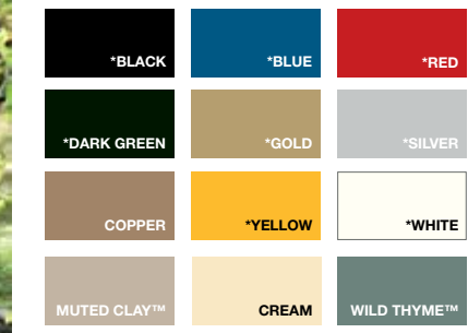
*available in aerosol

Glossy, smooth finish for a flawless high sheen available in a variety of sizes.