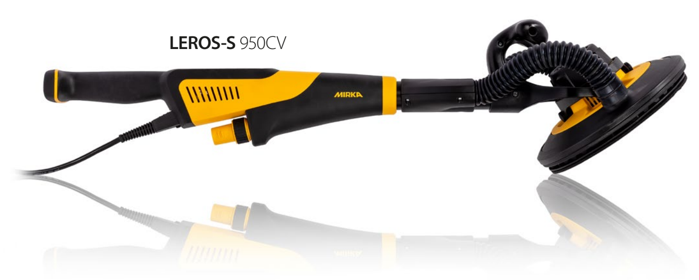
The new LEROS-S is a sibling to the successful LEROS wall sander. The new LEROS-S features the well-known abilities of the LEROS, but in a shorter, even more easily handled length.